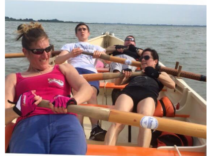
Rowhedge CRC demonstrating an extreme lean!