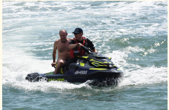
Swimmer brought back to the safety of the shore on our PWC

Our team has always attended so that we can provide a Policing presence on the water and help keep the Marine Community safe. We also work with Clacton Beach Patrol to keep the restricted zone clear so that aircraft have a safe and clear location to land in the event of an emergency.